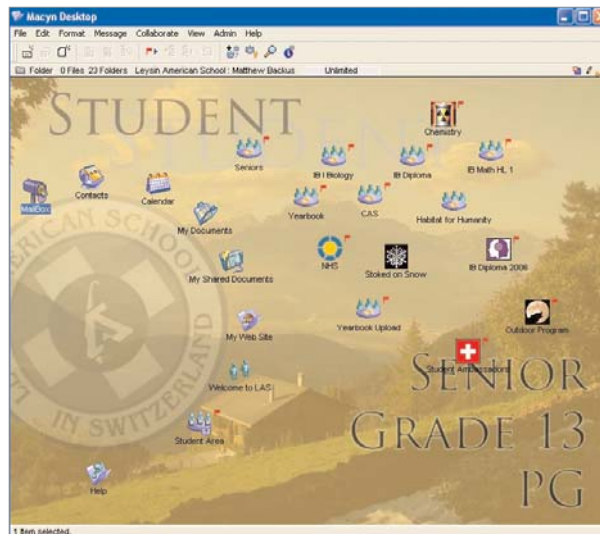
Leysin American School's Student Desktop